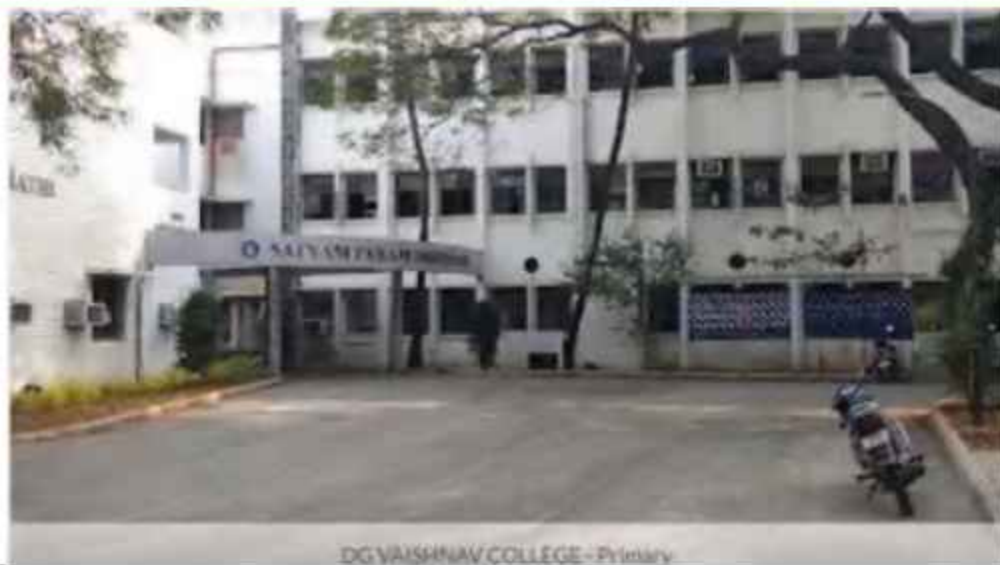
DG VAISHNAV COLLEGE - Primary